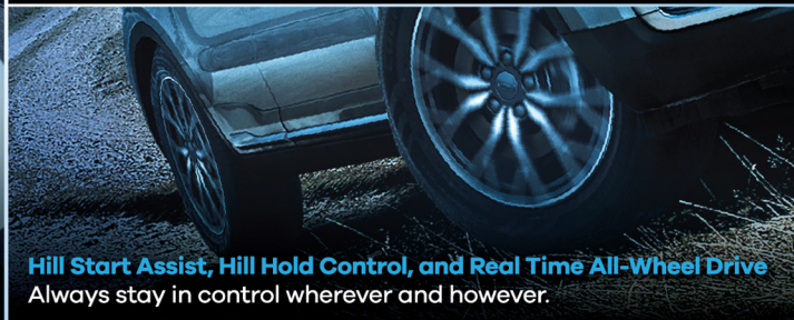
Hill Start Assist, Hill Hold Control, and Real Time All-Wheel Drive Always stay in control wherever and however.

Breathe in fresher, healthier air thanks to CN95 cabin filters.