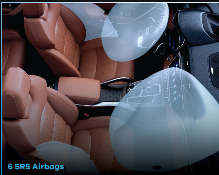
6 SRS Airbags

Safety is at a premium with the Azkarra. Knowing that you're safe makes you focus more on the refined ride.