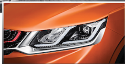
LED Daytime Running Lights