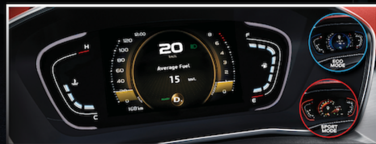
Customizable 7-inch LCD Instrument Panel.