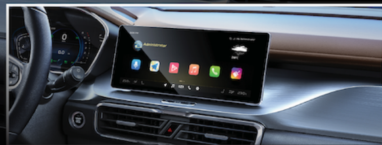
10.25-inch Floating Infotainment Panel with GKUI Smart Ecosystem

Everything just seems to be better when you're sitting comfortably on the Coolray's leather seats.