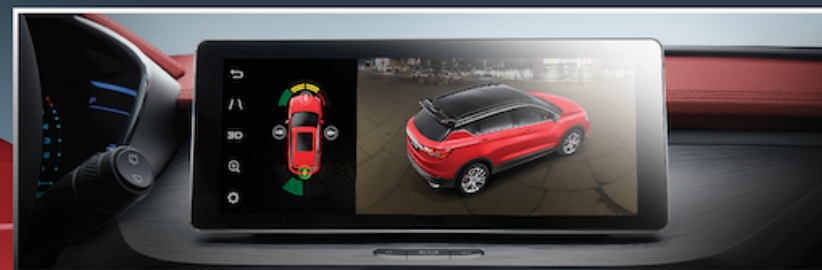
360° Panoramic Video