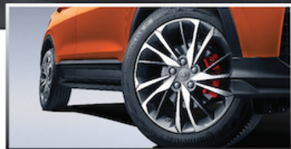
Dual-Color Turbine-Inspired Sports Rims