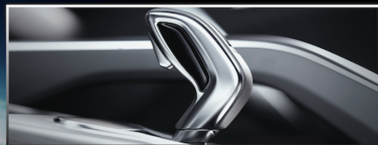
The jet-throttle inspired e-shift.

Technology and beauty come together to give you an exhilarating driving experience.