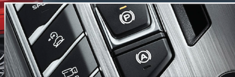
Electronic Parking Brake and Autohold