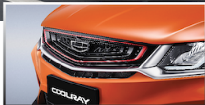
Expanding Cosmos Grille