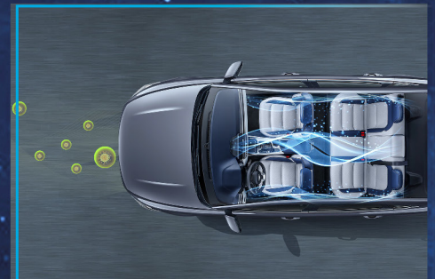
CN95 Cabin Filters