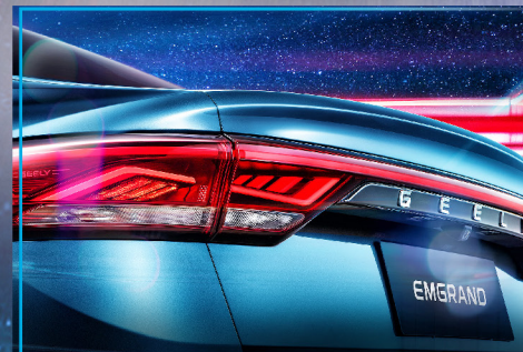
Rhythmic Tail Lights