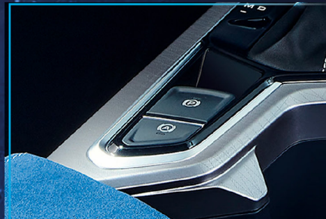
Electric Parking Brake + Autohold