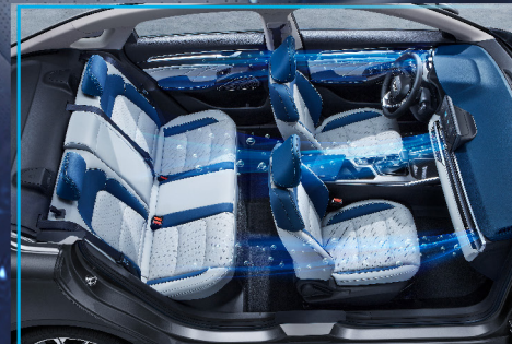
Intelligent Interactive Airconditioning