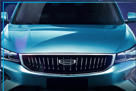
Energy Pulse Front Grille