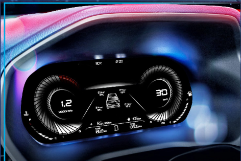
12.3" Full Digital Instrument Panel