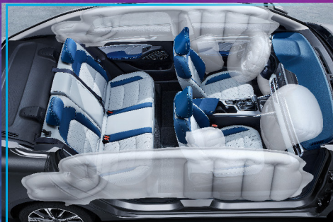
6 SRS Airbags