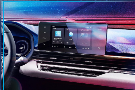
8" Infotainment Panel