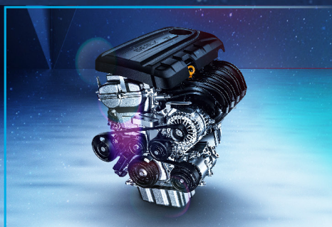
Smooth and Fuel-Efficient 1.5L 4-Cylinder D-CVVT Engine